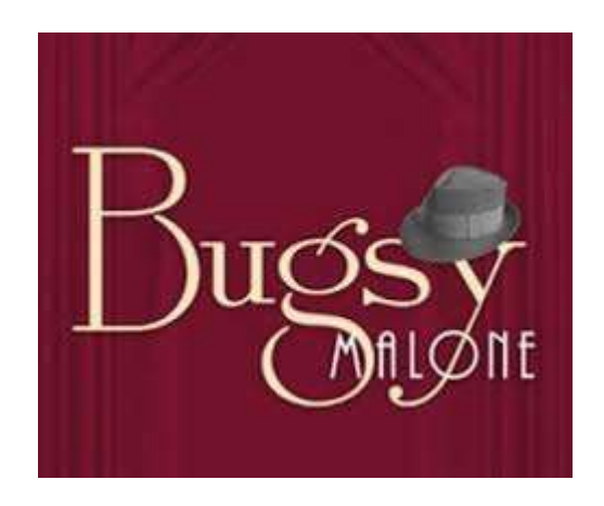
The Year 6 Production of 'Bugsy Malone' received rave reviews from children, staff and parents! Well done Year 6!